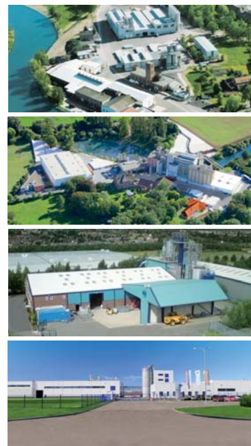
VIATOP® plants Lodenau, Calenberg (Germany), Mansfield (England) and Balakhna (Russia)

additives inside – for decades have been the benchmark for fiber additives delivering the best quality and functionality for modern asphalt concepts. Together with sophisticated road construction experts around the globe, we developed the innovative VIATOP® plus . A wide range of pelletized fiber additives for various additional functions enhance the properties of the final mixes. Get ready for the future – with VIATOP® plus .